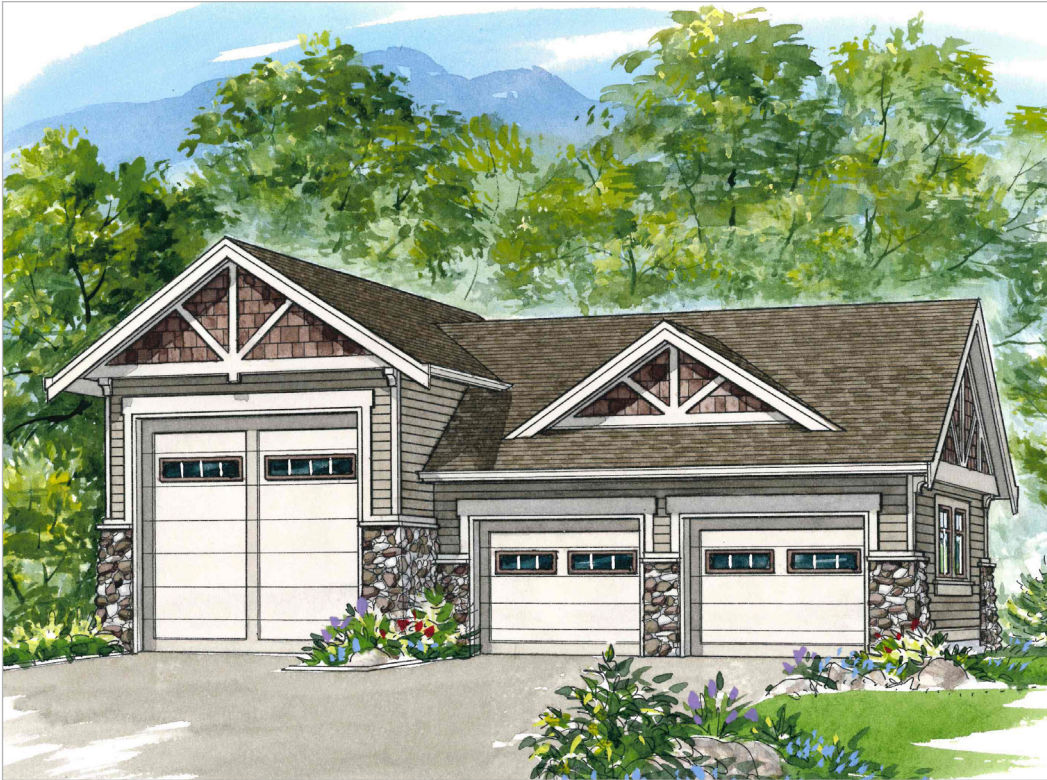
Designs, Images & Plans © Jenish House Designs Limited